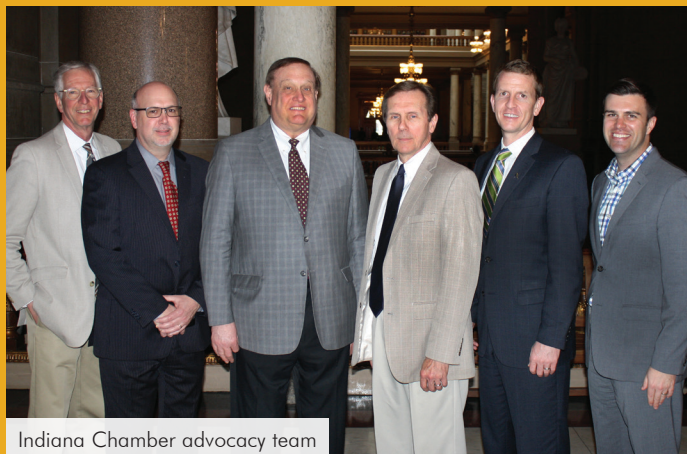
Indiana Chamber advocacy team

During the legislative sessions, lawmakers are kept advised on key business issues through various editions of the Legislative Agenda report and other communications that detail the Indiana Chamber's position on every bill that has a pro-jobs, pro-economy impact. The 2022 Legislative Vote Analysis measures the voting performance of individual legislators on bills that best reflect the Chamber's policy positions.